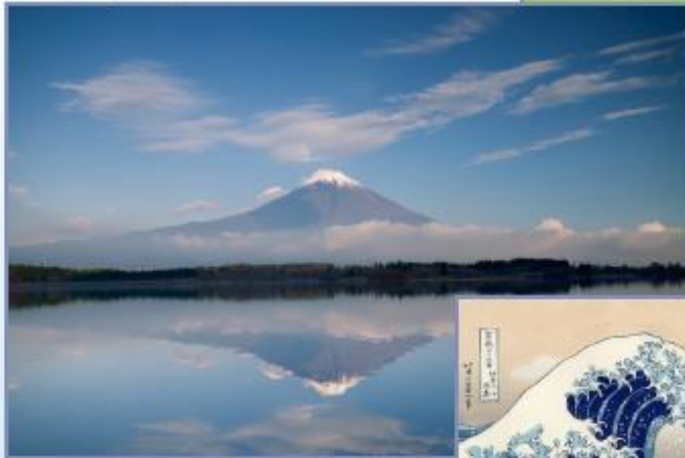
Mt Fuji reflected in Lake Motosu