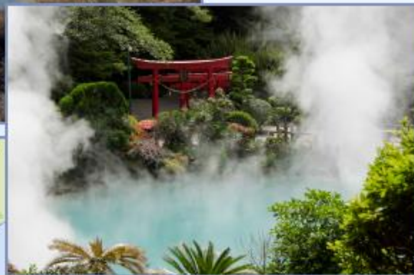
Hot springs in Beppu