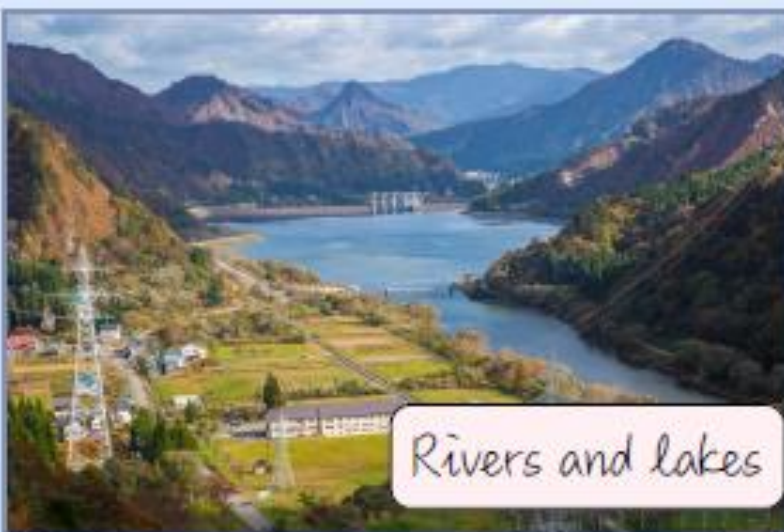
Rivers and lakes

Did you know, 66% of Japan is covered in forests!